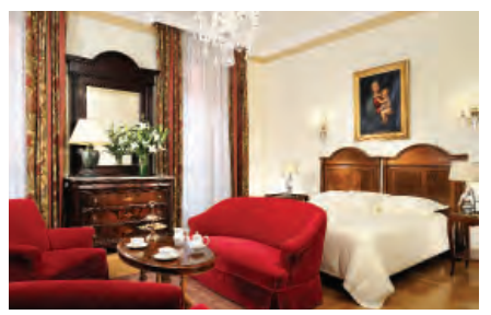
Deluxe room at Hotel d'Inghilterra

The Hotel d'Inghilterra enjoys a superlative position in the pedestrianised heart of the old town of Rome a couple of hundred yards from the famous Spanish Steps. The Hotel d'Inghilterra occupies an historic palace and today is a 5-star hotel with 88 rooms. The rooms are on a total of six floors reached by lift, and are all air-conditioned. The public