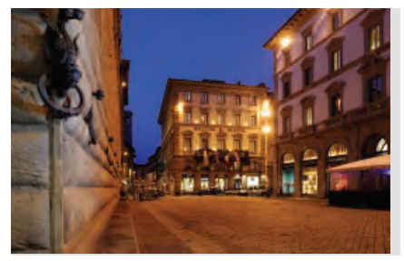
Hotel Helvetia and Bristol

A colourful and unique hotel, the Hotel Mascagni is an elegant haven in a central location in Rome, near the Trevi fountain, Via Veneto and Spanish Steps. With just 40 rooms this boutique hotel has an intimate and personal ambience. The rooms combine comfortable furnishings with often bold, statement wallpapers which give the hotel a unique appeal. A small bar and restaurant, where breakfast is served, are also available at the hotel and share the same combination of traditional yet cosmopolitan furnishings. The Hotel Mascagni is a comfortable and cosy base for exploring the city.