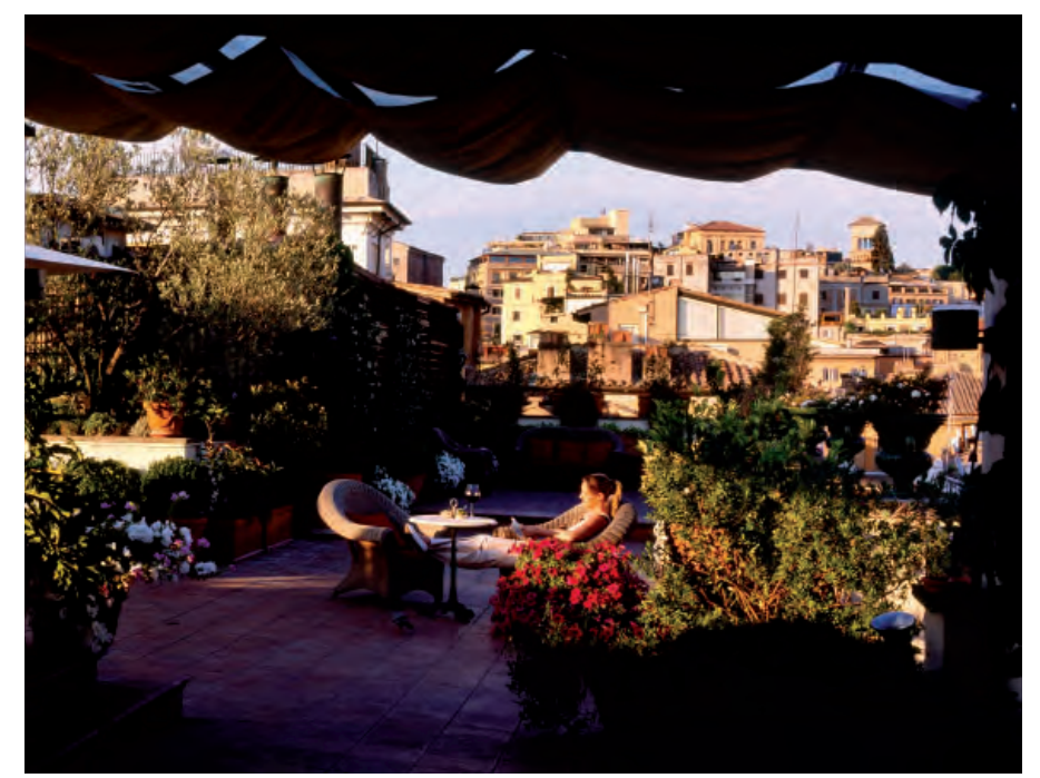
Roof garden at Hotel d'Inghilterra

End your rail holiday by travelling on a midday train from Lausanne to Paris. Change stations here and board the Eurostar to London where you arrive just before 8pm.