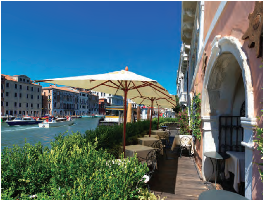
Grand Canal from Ca'Sagredo Hotel

A private boat will return you to Venice Santa Lucia station mid-morning, where you catch a train heading south to Tuscany. This is a relatively quick journey which takes you first